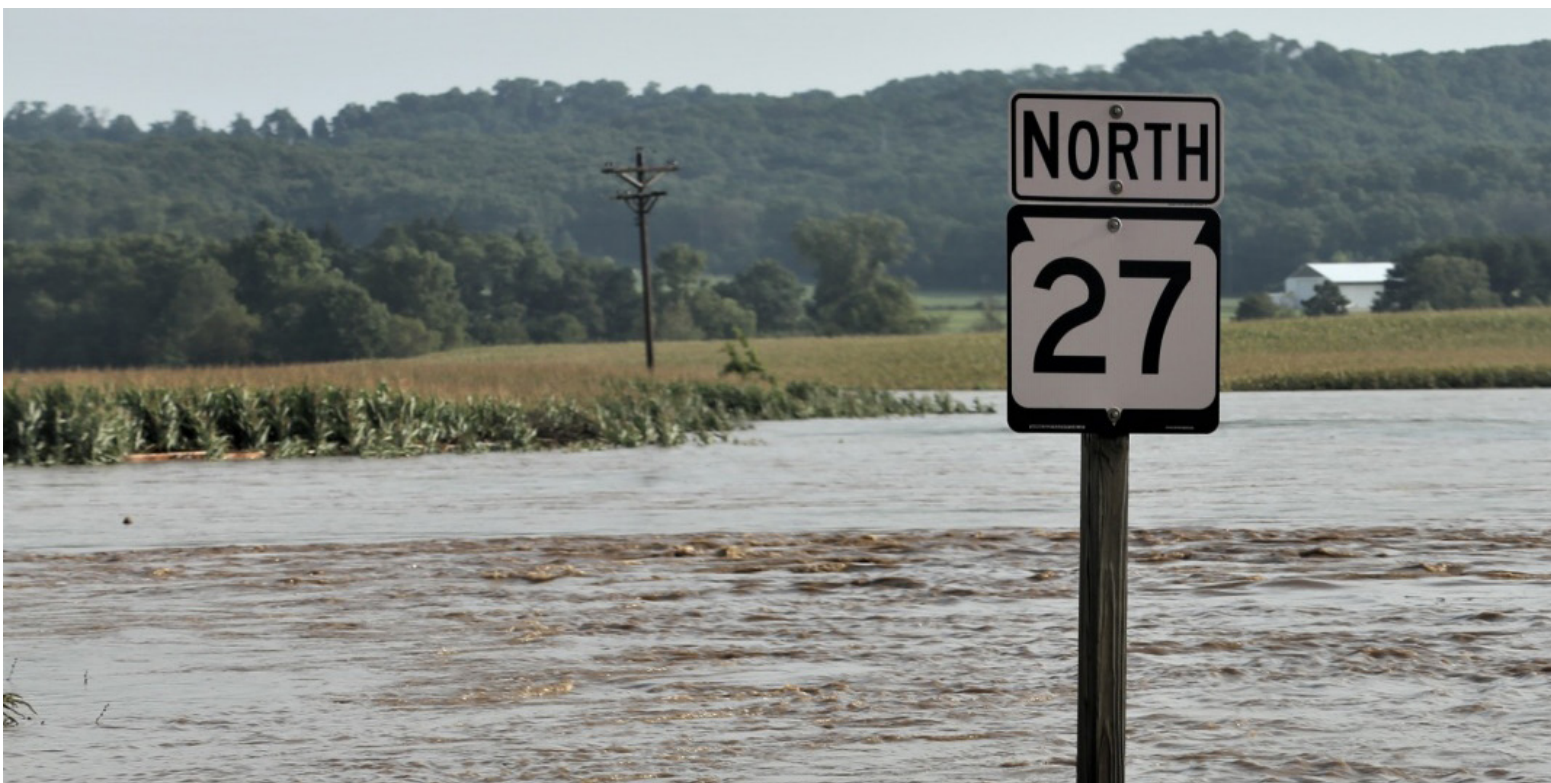
© Soil First® 2019 7-025_SF_05292019

If prevent plant is a possibility in your area , View our Prevent Plant Tips and Recommendations Today: ( https://bit.ly/2JWD0kd ).